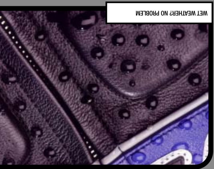
WET WEATHER? NO PROBLEM