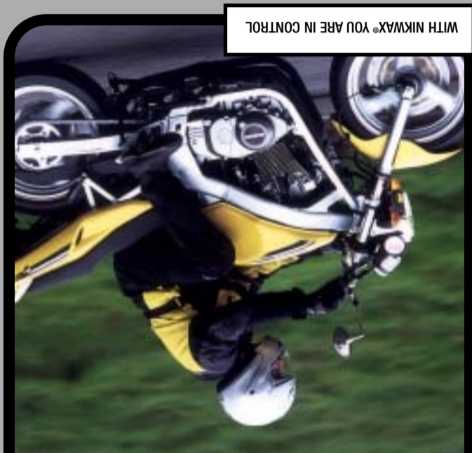
WITH NIKWAX® YOU ARE IN CONTROL