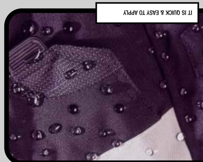
IT IS QUICK & EASY TO APPLY